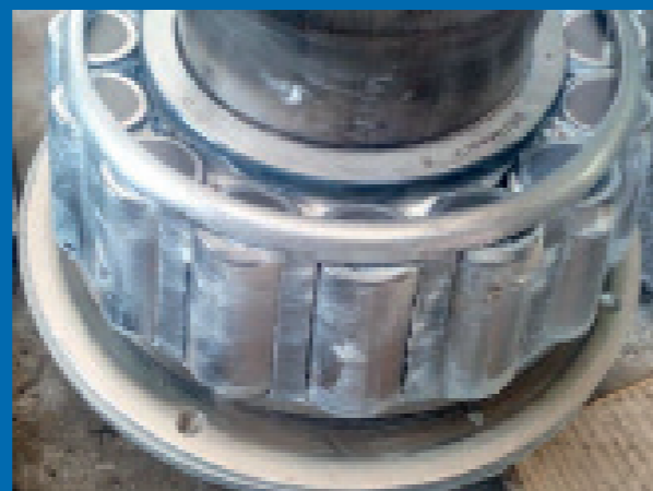
Bearings using ROCOL® foodlube premier 1 (after 5 months)